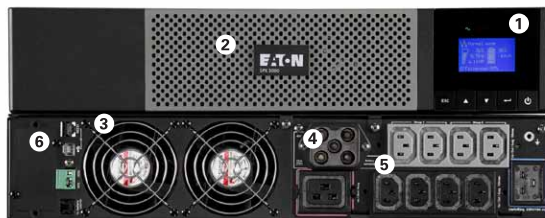
Eaton 5PX 3000i RT2U