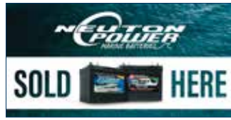
NEUTMARINESIGN Neuton Power Marine ACM Sign 600mm x 1200mm