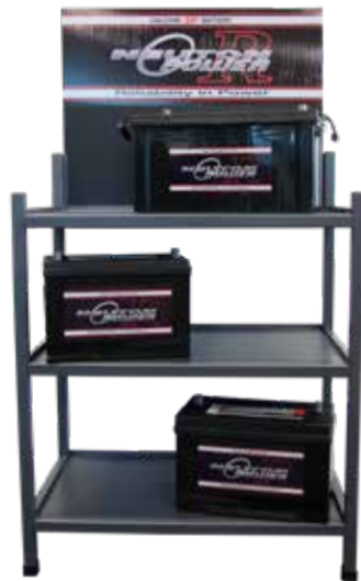
BATTSIGNNEUTONP + STANDBATTERY Neuton Power Sign 495mm x 645mm +