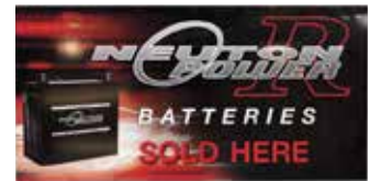
NEUTSIGN Neuton Power Sold Here PVC Sign 400mm x 800mm