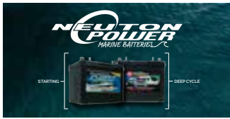
NPMARINESIGN Neuton Power Marine PVC Sign 400mm x 800mm