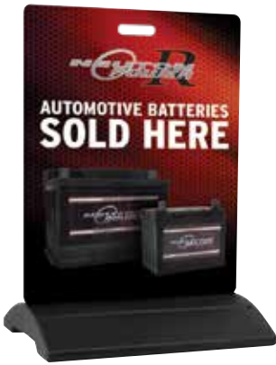
NEUTFPSIGN + NEUTFPBASE Neuton Power Footpath Sign 600mm x 800mm +