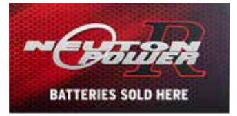
NEUTSIGNPVC Neuton Power PVC Sign 600mm x 1200mm