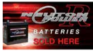
NEUTSIGNACM Neuton Power Sold Here ACM Sign 600mm x 1200mm