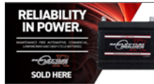
NEUTSIGNACM800 Neuton Power ACM Sign 400mm x 800mm